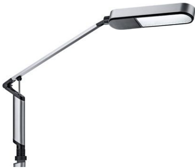
MAIA - DTE 111 F

connected load fitted with work equipment mains lead luminaire body material tubular sections material surface weight (net) fastening power consumption technology usage glare-free balance of articulation joints class of protection colour luminaire body colour of tubular sections article no.