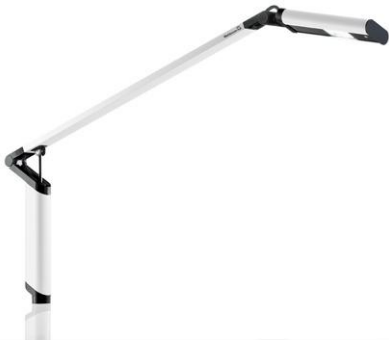
MINELA - ETL 1 F